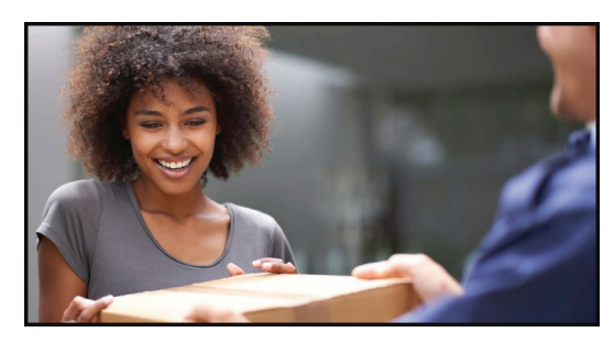
Awards sent to the recipient's home to engage family, or to recognize remote employees.